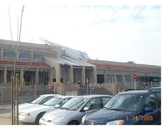
SCS Exterior South Facing