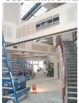
SCS Interior Lower Level