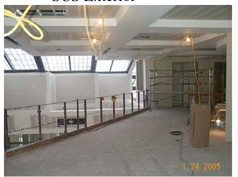
SCS Interior Upper Level