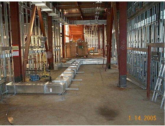
Kirsch Center Interior Lower Level